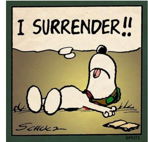
Activities of Daily Living